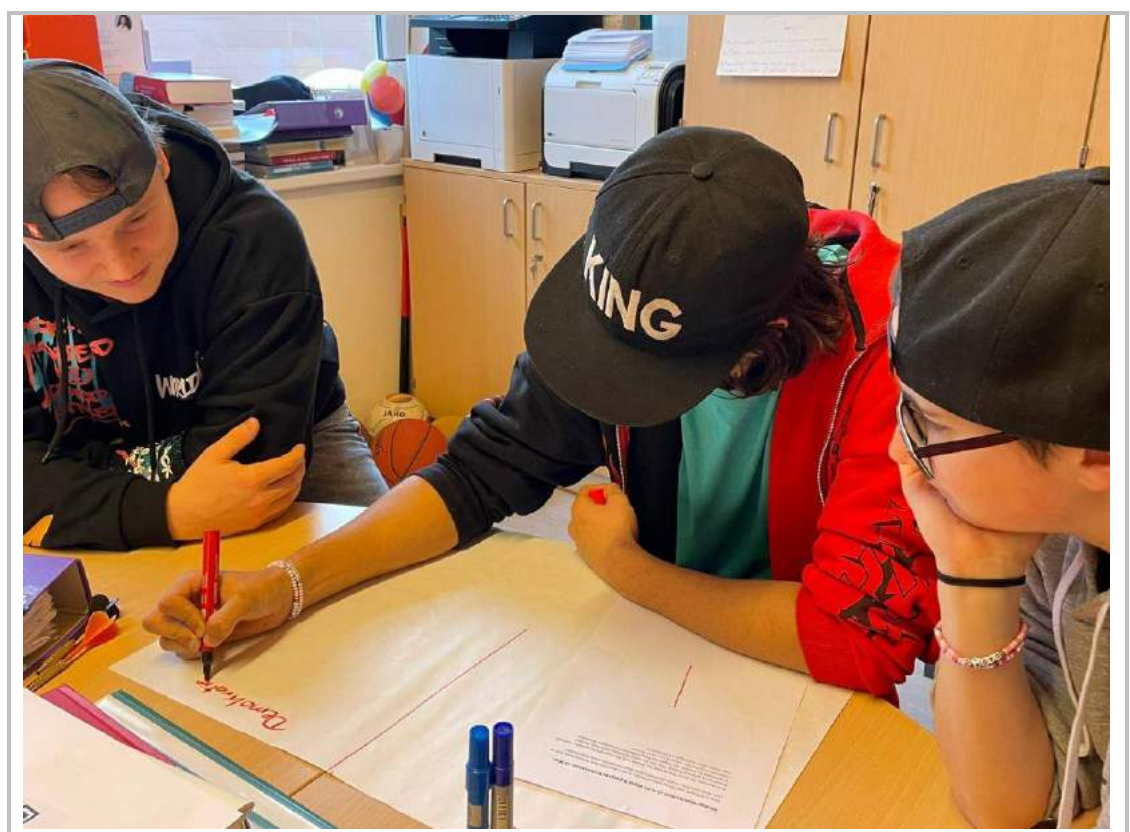
This resulted in finding the first demands e.g. topics, which are close to the young people and to which they might want to work further.

With the findings from the workshops we could clarify the topics we would work further in the process and cluster field of topics for the National meeting, where most of the participants come together on the national level.